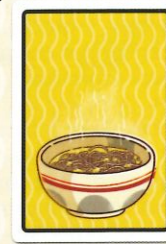
Ramen Bowl noodle-side up

Any unused Ramen Bowl Cards and Spoon Tokens are placed back into the package and will not be used during this game.