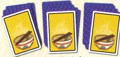
Three finished bowls of ramen

At the end of the game, players score points for each bowl of ramen they ate based on the Flavor inside each bowl.